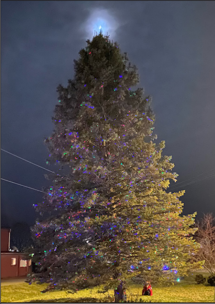
At the village Tree Lighting the moon played star for our laser-lit tree while a little one looked up from below.

The Lions' Dine and Dab lunch and bingo event for seniors was a great success.