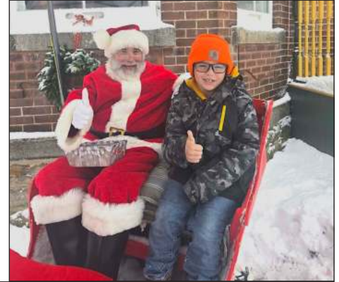
Santa and his crew dropped in at the Legion, and later returned to visit Ridgway!