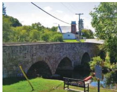
Serving Lyndhurst & Area

129 Bay St. Seeley's Bay Every Tuesday, 10 am - Noon Phone: 613-382-4434